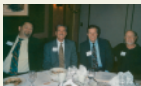
ENTERTAINMENT LAW LUNCHEONS COVER ETHICAL ISSUES AND GENDER BIAS