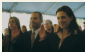
FALL 2004 SWEARING-IN CEREMONY