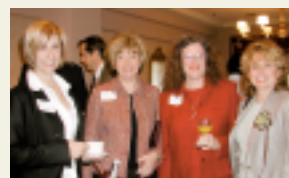
CLASSES OF '75, '85 AND '95 REUNITE