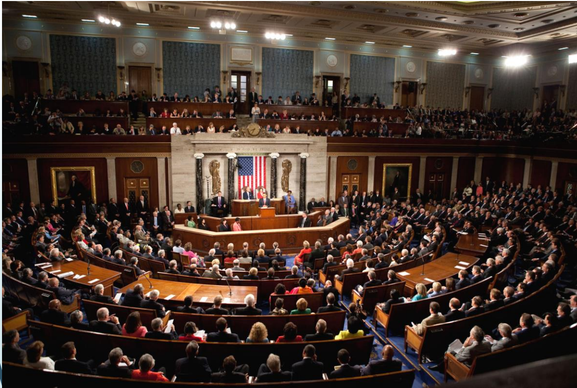
Members of Congress