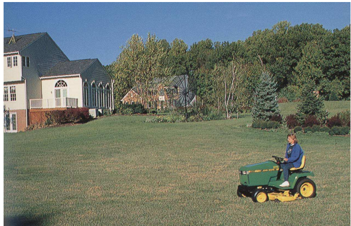
Figure 1. The idealized American urban landscape consists of lawns and garden patches around a single-family household. Maintaining this “dreamscape” requires many human management inputs including lawn mowing.

In the United States, over 80% of the total population—more than 250 million people—live in the urban, suburban and exurban landscapes that cover over 25% of the country's terrestrial surface; these numbers will likely increase well into the future (Brown et al. 2005; UN 2007). In urbanized landscapes, 79% of American households help manage over 128,000 km 2 of lawns and gardens—more area than covered by any single food crop—and thus contribute to a $147.8 billion landscaping industry (NGA 2004; Milesi et al. 2005; Hall et al. 2006). The magnitude of the urban landscaping endeavor and its associated green spaces have emerged from our collective pursuit of the American dream in which homeowners maintain idealized lawns and gardens around their homes to symbolize, in part, successful realization of this iconic vision (Figure 1; Jenkins 1994). Arguably then, the majority of Americans interact more today with lawns and gardens (conceptually, physically, and emotionally) than any other outdoor environments.