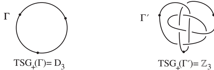
FIGURE 2. Embeddings of a triangle with different topological symmetry groups.

For example, let \gamma denote a circle with three vertices. If the embedded graph \Gamma is an unknotted circle, then \text{TSG}_+(\Gamma) = D_3 , the dihedral group with 6 elements. If we re-embed \Gamma as a non-invertible knot \Gamma' , then \text{TSG}_+(\Gamma') is the subgroup \mathbb{Z}_3 (in Figure 2, \Gamma' contains the non-invertible knot 8_{17} ). On the other hand, for any embedding \Gamma'' of \gamma in S^3 there will be an orientation preserving diffeomorphism of (S^3, \Gamma'') which cyclically permutes the three vertices (obtained by slithering \Gamma'' along itself) inducing an order 3 automorphism of \Gamma'' . Hence there is no embedding \Gamma''' of \gamma such that \text{TSG}_+(\Gamma''') is either \mathbb{Z}_2 or the trivial group. Thus not all of the subgroups of \text{TSG}_+(\Gamma) can occur as \text{TSG}_+(\Gamma''') for some re-embedding \Gamma''' of \Gamma in S^3 .