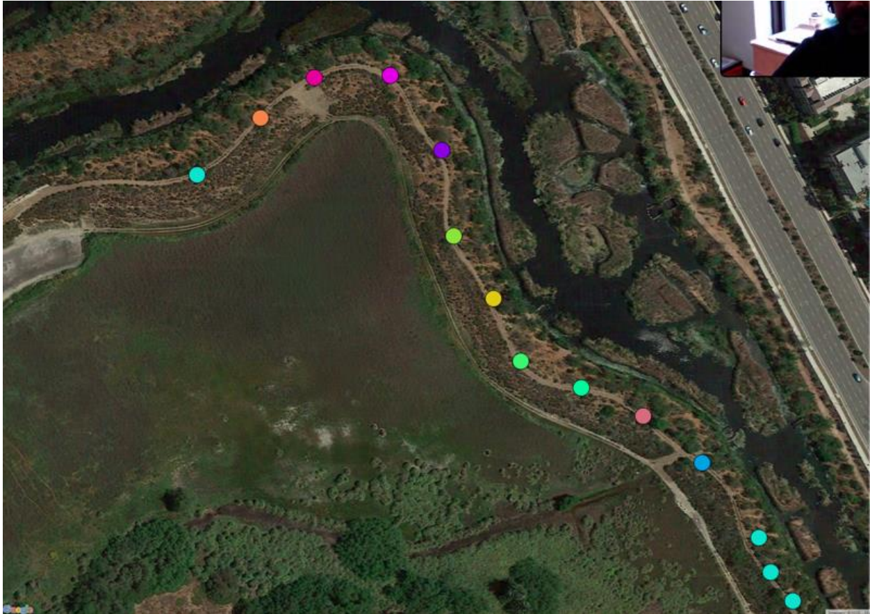
Figure 2. Differential sugar preferences of each population at each site in the Ballona Wetlands of Los Angeles, California.