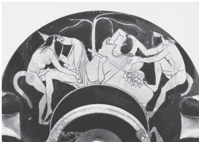
Figure 4. Makron (painter), Attic Kylix (Drinking Cup) with Satyrs and Sleeping Maenads , made in Athens, ca. 490 BCE, terracotta, 8.9 x 21.8 cm. Museum of Fine Arts, Boston, Henry Lillie Pierce Fund, 01.8072.

force behind the characterization of the satyrs as humorous rather than serious figures. Satyrs cannot be threatening if everyone is laughing at them. 27