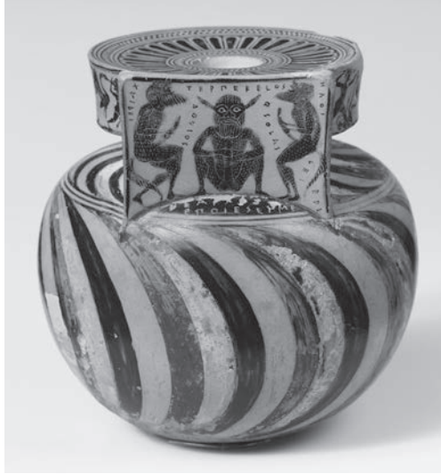
Figure 7. Nearkhos (potter), Aryballos with Masturbating Satyrs, ca. 570 BCE, terracotta, height 7.8 cm. The Metropolitan Museum of Art, Purchase, The Cesnola Collection, by exchange, 1926 (26.49), New York, New York.

sleeping Eros, hermaphrodites, and even satyrs like the Barberini Faun became popular in the Hellenistic period. The bronze statue of the sleeping Eros in the Metropolitan Museum of Art is not just the cute image of a chubby toddler tucked out after a long day but a representation of one of the most powerful and feared gods in a rare moment of defenselessness. 38 It is only in sleep that such powerful and liminal creatures can be approached by mere humans. It is a different variation on the similar theme illustrated in archaic images of satyrs approaching sleeping maenads. In all cases, sleep is a liminal state that leaves the sleeper vulnerable and allows interactions between figures that would not be possible otherwise. It is to this group of Hellenistic sleeping figures that the Barberini Faun belongs. When awake, the Faun , with his heavy musculature and hybrid nature, would have been a physically powerful and frightening figure. Yet in sleep he is transformed from a figure to be feared into a figure to be desired.