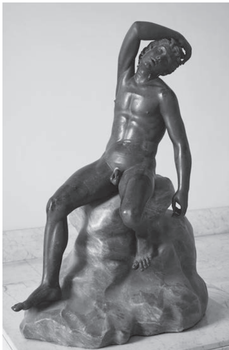
Figure 10. Unknown artist, Statue of Sleeping Satyr , from the Villa dei Papyri, Herculaneum, bronze, life-sized. Museo Archeologico Nazionale, Naples, Italy.

drunkenness, like the Barberini Faun , but he differs from the Faun in both the emphasis on his animal characteristics and his soft, adolescent body. In addition, technical analysis of the statue has shown that the upright seated position of the Herculaneum satyr is the product of eighteenth-century restorations. He was probably originally displayed in an entirely reclined position, matching that of another statue found at the villa that represents an awake but drunken middle-aged satyr collapsed against a rock. 44 This reclining position, in addition to the narrower gap between the Herculaneum satyr's legs, does not draw the eye to his genitalia, as is the case with the Barberini Faun , nor does he have the well-developed musculature of the Faun . Despite the iconographical similarities between both the Derveni and Herculaneum satyrs and the Barberini Faun , neither of the former embodies the same sexuality nor desirability as the Faun . Like the