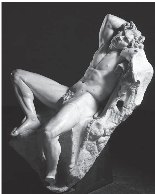
Figure 2. Unknown artist, Barberini Faun , side view, found in Rome, third or second century BCE, marble, height 216 cm. Glyptothek, Staatliche Antikensammlung, Munich, Germany.

With clear indications of maturity in his face and body, the Faun fits into this category.