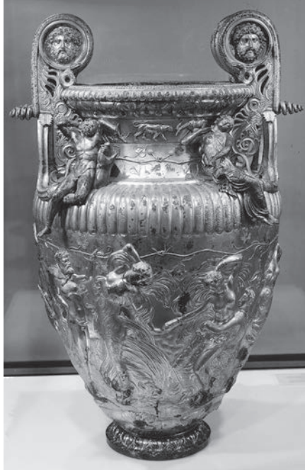
Figure 9. Unknown artist, Derveni Krater , side B, from Derveni, fourth century BCE, bronze, Krater height 90.5 cm. Archaeological Museum of Thessaloniki, Thessaloniki, Greece.

pose, none of the satyrs in this position in archaic and classical art are depicted asleep.