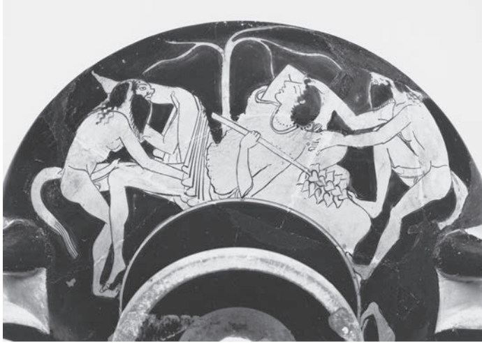
Figure 4. Makron (painter), Attic Kylix (Drinking Cup) with Satyrs and Sleeping Maenads , made in Athens, ca. 490 BCE, terracotta, 8.9 x 21.8 cm. Museum of Fine Arts, Boston, Henry Lillie Pierce Fund, 01.8072.

force behind the characterization of the satyrs as humorous rather than serious figures. Satyrs cannot be threatening if everyone is laughing at them. 27