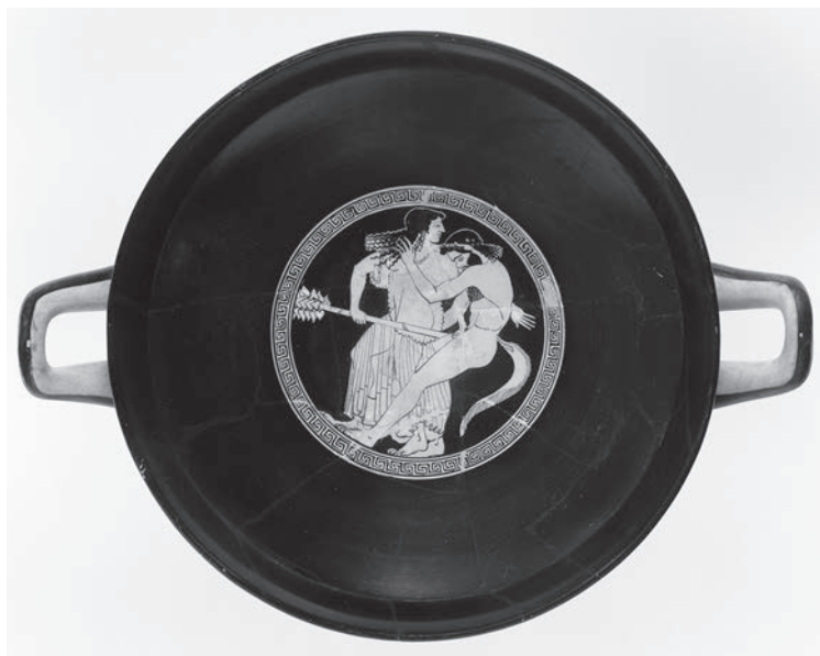
Figure 5. Makron (attributed painter), Attic Red-Figure Kylix (Drinking Cup) with Maenad and Satyr , made in Athens, ca. 490–480 BCE, terracotta, 12.7 cm high by 28.6 cm deep. The Metropolitan Museum of Art, Rogers Fund, 1906, New York, New York.

symbol of her connection with Dionysos. A second maenad on the cup continues to slumber while one satyr reaches for her hair and another parts her legs and lifts her skirt.