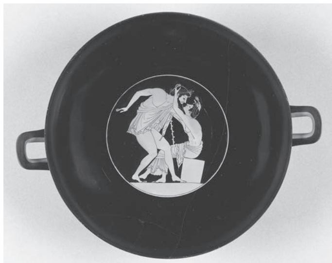
Figure 13. Carpenter Painter (attributed), Interior of Attic Red-Figure Kylix with Pederastic Scene , made in Athens, ca. 510–500 BCE, 11 x 38.1 x 33.5 cm. J. Paul Getty Museum, Villa Collection, Malibu, California.

tween an eromenos and erastes was subject to greater public scrutiny in terms of appropriate behavior and practices. 51