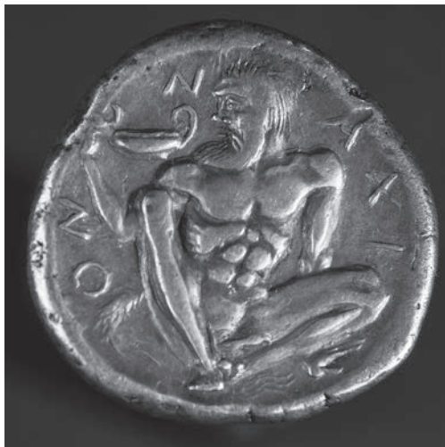
Figure 8. Unknown artist, Tetradrachm with a Ithyphallic Satyr on the Reverse , from Naxos, Sicily, silver, ca. 460 BCE, 2.9 x 2.8 cm. Jean Vinchon, Numismatist, Paris.