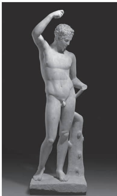
Figure 12. Praxiteles (original: attributed), Statue of a Pouring Satyr , ca. 81–96 CE (Roman copy of a fourth-century BCE original), 163 x 53 x 58.4 cm. J. Paul Getty Museum, Villa Collection, Malibu, California.

theme of the sexualized satyr. While the originals are no longer extant, numerous Roman copies exist of two sculpted satyrs, commonly known today as the Resting Satyr and the Pouring Satyr (figs. 11 and 12). 45 The originals of these two statues are commonly attributed to the sculptor Praxiteles and dated to the fourth century BCE. 46