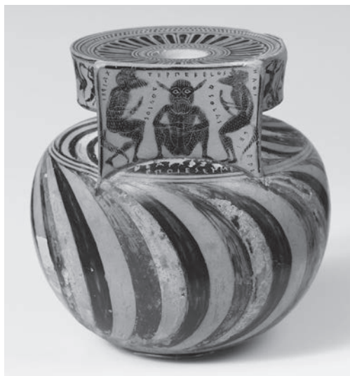
Figure 7. Nearkhos (potter), Aryballos with Masturbating Satyrs, ca. 570 BCE, terracotta, height 7.8 cm. The Metropolitan Museum of Art, Purchase, The Cesnola Collection, by exchange, 1926 (26.49), New York, New York.

sleeping Eros, hermaphrodites, and even satyrs like the Barberini Faun became popular in the Hellenistic period. The bronze statue of the sleeping Eros in the Metropolitan Museum of Art is not just the cute image of a chubby toddler tucked out after a long day but a representation of one of the most powerful and feared gods in a rare moment of defenselessness. 38 It is only in sleep that such powerful and liminal creatures can be approached by mere humans. It is a different variation on the similar theme illustrated in archaic images of satyrs approaching sleeping maenads. In all cases, sleep is a liminal state that leaves the sleeper vulnerable and allows interactions between figures that would not be possible otherwise. It is to this group of Hellenistic sleeping figures that the Barberini Faun belongs. When awake, the Faun , with his heavy musculature and hybrid nature, would have been a physically powerful and frightening figure. Yet in sleep he is transformed from a figure to be feared into a figure to be desired.