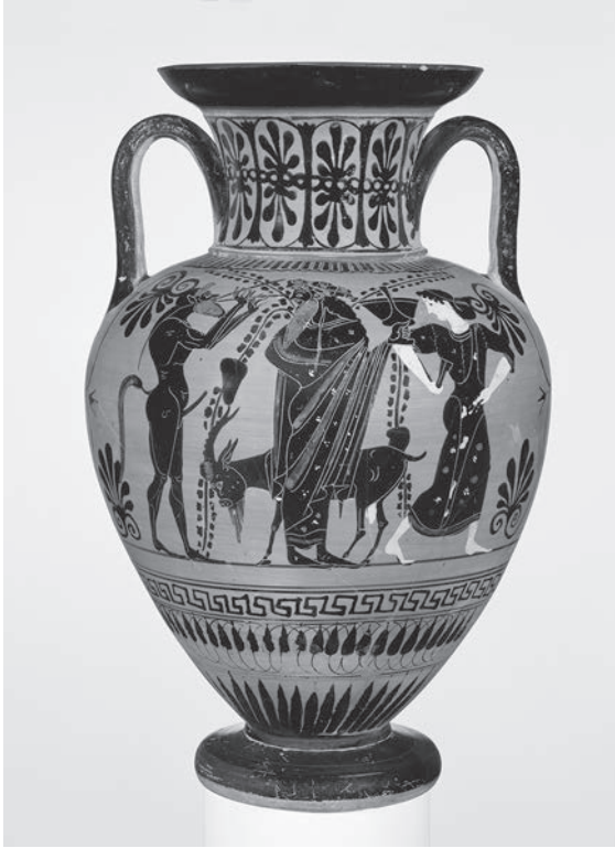
Figure 3. Unknown artist, Amphora with Dionysos, Satyr, and Maenad , made in Athens, ca. 510 BCE, terracotta, 40.3 x 26.2 cm. J. Paul Getty Museum, Villa Collection, Malibu, California.

almost always male, and their masculinity became their greatest defining characteristic. 21