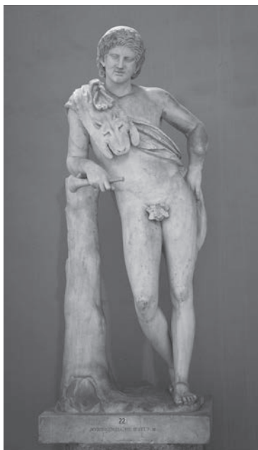
Figure 11. Praxiteles (original: attributed), Statue of a Resting Satyr , mid-second century CE (Roman copy of a fourth-century BCE original), height 170.5 cm. Galleria delle Statue, Museo Pio Clementino, Vatican Museums, Rome, Italy.

Faun , these two images are of odd hybrid creatures, neither human nor animal, who are less dangerous when in the liminal state of sleep, similarly to other Hellenistic sleeping figures, but the role of the Faun as a sexual object sets him apart from these other satyrs. While the artist of the Barberini Faun drew upon established iconography and explored similar themes as contemporary Hellenistic artists, notably that of the powerful satyr made vulnerable by sleep, his composition communicated a different message speaking to Hellenistic ideas of masculine sexuality.