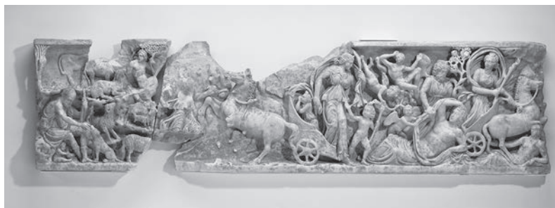
Figure 6. Unknown artist, Front of a Roman Sarcophagus with Myth of Endymion , ca. 210 CE, marble, 54.3 x 214 cm. J. Paul Getty Museum, Villa Collection, Malibu, California.

with one arm above his head in the sleeping gesture as Selene approaches him with amorous intent. 34 His exposed nude body and youthful face highlight his desirability—a vulnerability and desirability that parallel those of the Barberini Faun . 35 However, there are some important differences between the two figures. The first is that while numerous representations of Endymion have survived from the Roman period, only a handful of Greek depictions of the hero are known. 36 While the myth of Endymion was well known in the Greek world, and his story appears in a number of literary sources, he was not a popular subject in Greek art. The artist of the Barberini Faun may have been inspired by the myth of Endymion, but it is unlikely that the visual iconography of the sexualized sleeping male was previously established by Endymion. In addition, the depiction of Endymion with a youthful physique in later Roman art more closely conforms to the traditional idea of the adolescent boy as an acceptable sexual object compared to the mature Faun .