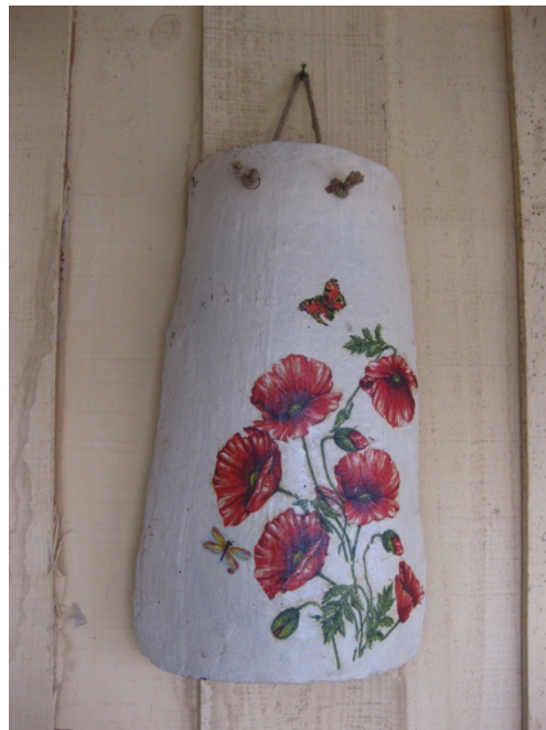
Figure 2. Adornments made of adobe slabs.

Also, examples of art making occurring in the community primarily focused on crafts made to sell, in order to make a living. An example of these are the adobe slabs that were remnants of fallen houses, which one temporarily housed community utilized to make wall adornments to sell (Figure 2). These artistic responses are juxtaposed with research coming from the United States and Europe (e.g., Bardot, 2008; Coholic, 2011; Prescott et al., 2008), depicting art used predominantly for personal expression of feelings, processing traumatic events or communicating one's experience.