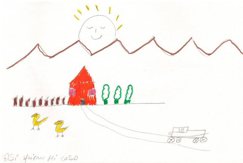
Figure 6. I want my house like this one.