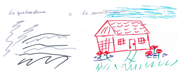
Figure 5. María Eliana's drawing: The breakage and the reconstruction.