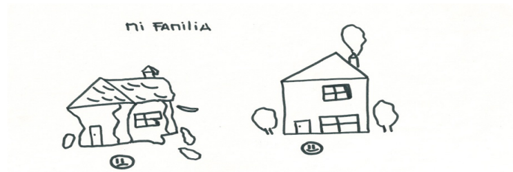
Figure 4. Fernanda's drawing: My family.