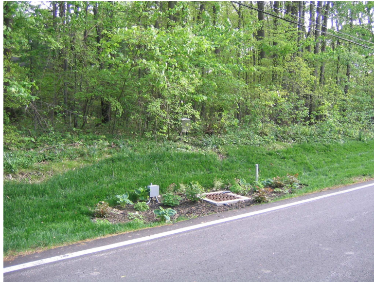
Figure 3. A bioswale was installed at this location in Orange Village (a suburb of Cleveland OH, USA) to expand infiltration opportunities for excess stormwater runoff generated by roads, nearby residential development, and legacy drainage issues. A catch basin was installed in the center of the bioswale run wherein monitoring gear is installed among the attractive horticultural plantings.

supported by simulations, which indicate that micro-topographic influences on flow concentration can contribute to local flooding in urban areas, and that localized flooding may be mitigated by management of flows at the level of local micro-topography (i.e., across landscapes and within individual parcels; Aronica and Lanza 2005). LID practices are also increasingly recognized as viable options for stormwater permitting and in the reduction of overflows from combined sewer systems (US Environmental Protection Agency 2008).