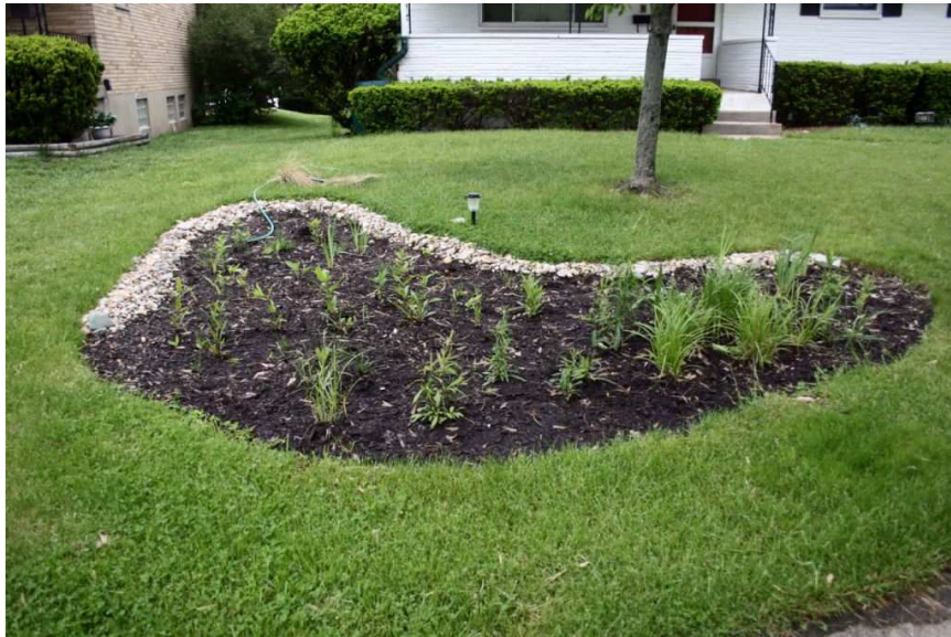
Figure 2. A nascent rain garden implemented in a neighborhood that drains to the Shepherd Creek. This one-year old planting survived drought conditions in 2007 and plant cover is starting to fill in. Due to lack of grade and proximity to a sidewalk area, this rain garden was installed without an underdrain. Gardens without underdrains were dug deeper (~0.6 m) to provide slightly more infiltration capacity than rain gardens with underdrains (which were about 0.5 m deep). Note that the homeowners have used an ordinary garden hose to route rain barrel overflow to the rain garden.

50% coverage) and antecedent moisture conditions dictate the unique and dynamic hydrology of pervious surfaces. This affects the capacity of pervious surfaces to capture runoff volume, and their tendency to produce runoff itself. This can occur via well-known hortonian (infiltration-excess) or saturation-excess mechanisms of runoff production. Second, impervious surfaces can be disconnected, wherein runoff from these surfaces flows onto adjacent pervious areas. Patterning of impervious areas in urban areas tend to leave pervious areas as sometimes isolated patches that retain a high degree of hydraulic connectivity to impervious areas. This typically leaves the pervious area (if it was relied upon for infiltration of stormwater runoff) undersized and unable to offer sufficient capacity for the amount of runoff generated from surrounding impervious areas. A simulation of LID effectiveness at the residential level undertaken by Xiao et al. (2007) showed that infiltration and surface runoff processes are sensitive to soil physical properties and the depth of soil to bedrock or other restrictive layers. Therefore, implementation of effective LID in great part relies upon specific knowledge of soil hydrology and soil physical properties, and it follows that assessment of these properties will largely dictate the type of LID practice used in a given situation and its capacity for retaining and infiltrating stormwater runoff.