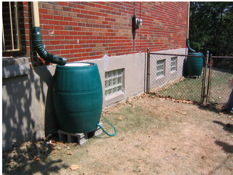
Figure 1. At this residence, rain barrels were installed under several downspouts. A rain garden was installed in the backyard, providing for a more complete on-site detention of stormwater volume.

Existing pervious surfaces in urban areas such as parks, lawns, and gardens provide some capacity for infiltration of stormwater runoff quantity, but this is conditional and relies upon type and condition of vegetative cover, soils, and the type and extent of impervious surface in the drainage area. There are several reasons why pervious cover may be overemphasized for its role in the mitigation of stormwater runoff. First, the type and condition of land cover (e.g., turf at