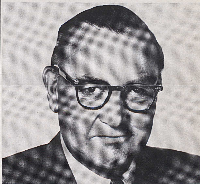
GOVERNOR EDMUND G. BROWN

Vol. 5 No. 3 LOYOLA UNIVERSITY SCHOOL OF LAW April, 1964