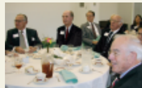
GRAND AVENUE GANG GATHERING