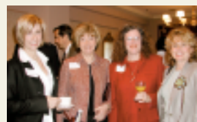
CLASSES OF '75, '85 AND '95 REUNITE