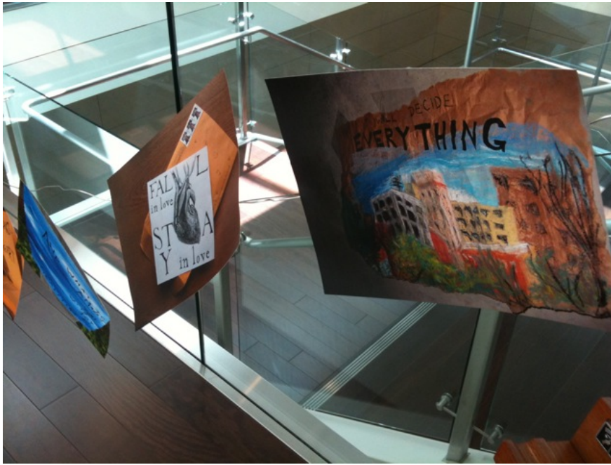
The ASLMU Student Art Walk enlivened the library's third level gallery space this spring.