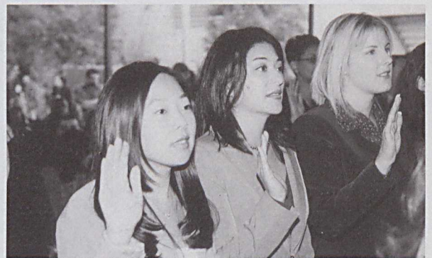
Members of the 2001 class.