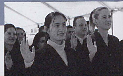
Left to Right Attorney & the Media Fresno Alumni Mixer Awards Breakfast and Swearing-In Ceremony Entertainment Law Luncheon Series