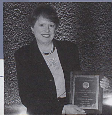
Top: Grand Avenue Gang "Symposium" Luncheon Bottom: Orange County Reunion