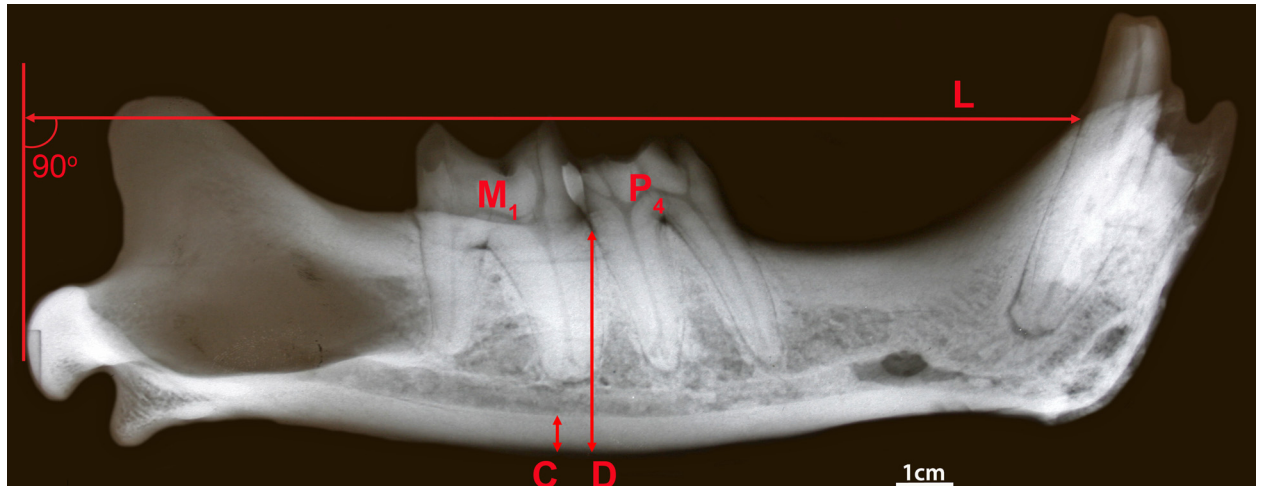
Fig 1. Radiograph of mandible of S. fatalis , with the relative cortical width, Cort, measurement (C, the cortical bone width); D, the mandible width, and L, the jaw length (posterior condyloid to the posterior alveolar emergence of the canine).