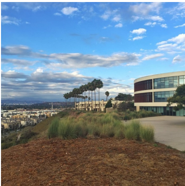
The Bluff on a cloudy day.