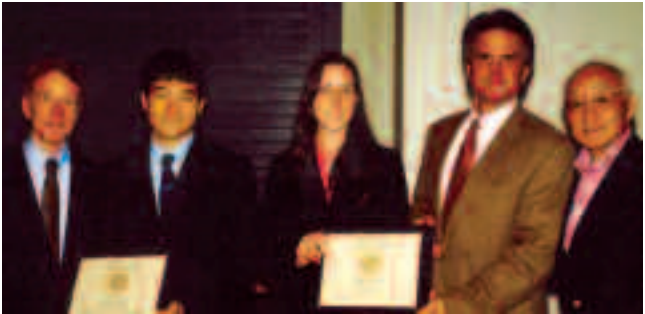
Loyola Law School thanks its alumni who have volunteered as judges in the competition: