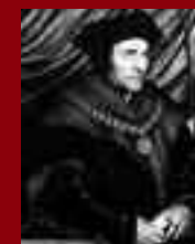
St. Thomas More by Hans Holbein

HISTORY OF THE RED MASS The first recorded Red Mass, a special Mass for the bench and bar, was celebrated in Paris in 1245. In England, the tradition began about 1310, during the reign of Edward I. The priest and the judges of the high court wore red robes, thus the celebration became known as the Red Mass. The tradition of the Red Mass continued in the US—each year, the members of the US Supreme Court join the president and members of Congress in the celebration of the Red Mass at the National Shrine of the Immaculate Conception. The Red Mass is also celebrated in most other state capitals and major cities throughout the US.