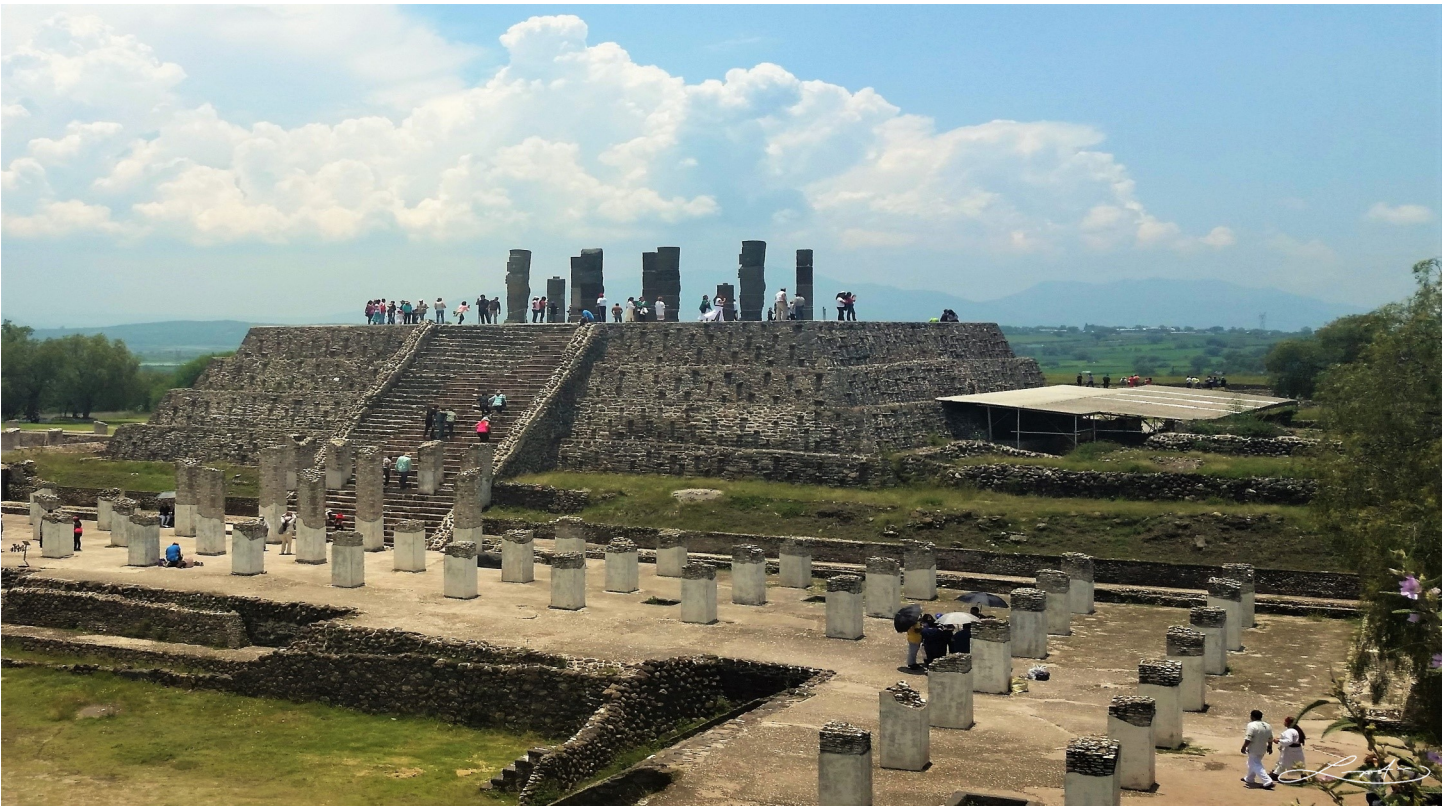
Las Pirámides de Quetzalcoatl – Tall and strong stand the Toltec warrior statues on top of the pyramid devoted to the feathered serpent deity. The same god that often became a part of my childhood bedtime stories.