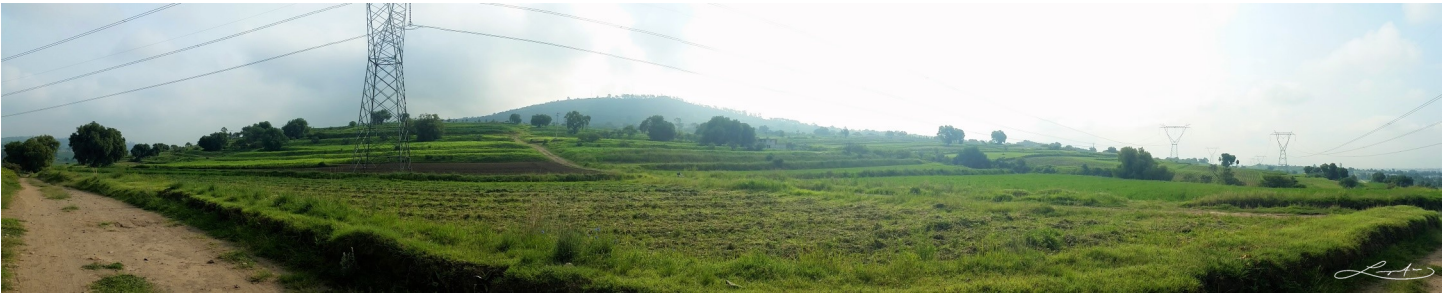
El Cerro – The very familiar valleys that made up the backyard to my abuela's house now a hiking trail destination during visits to what once used to be home.