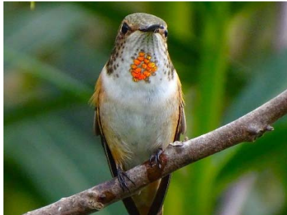
Female Allen's