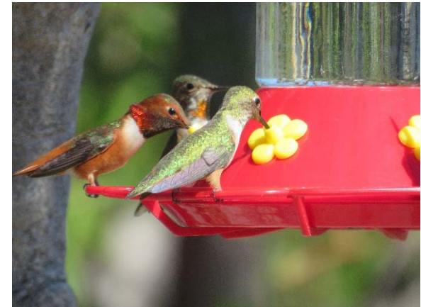
Hummingbirds at the Gottlieb Native Garden

Q: How often do hummingbirds have to feed?