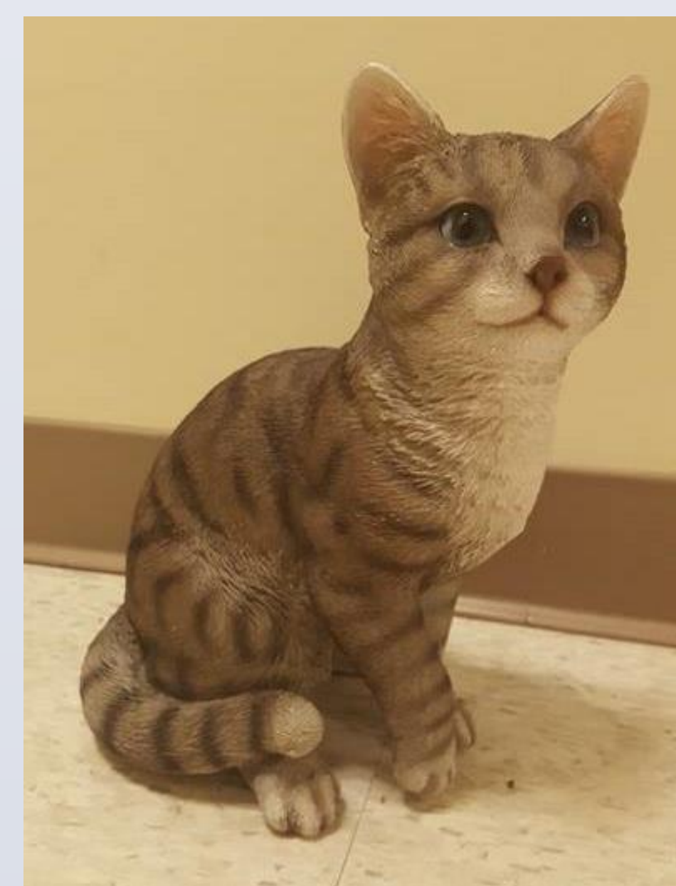
House Cat decoy