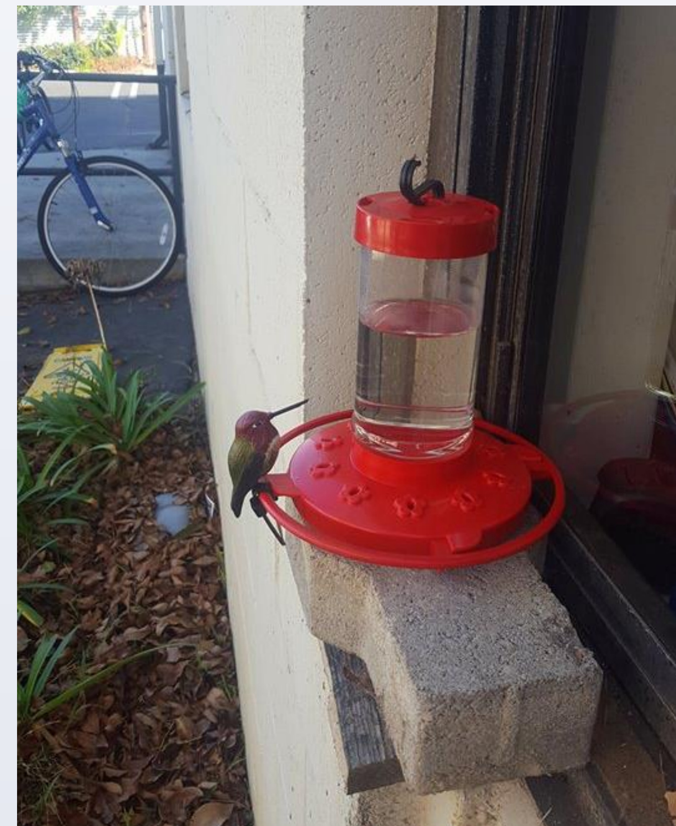
Male Anna's hummingbird decoy