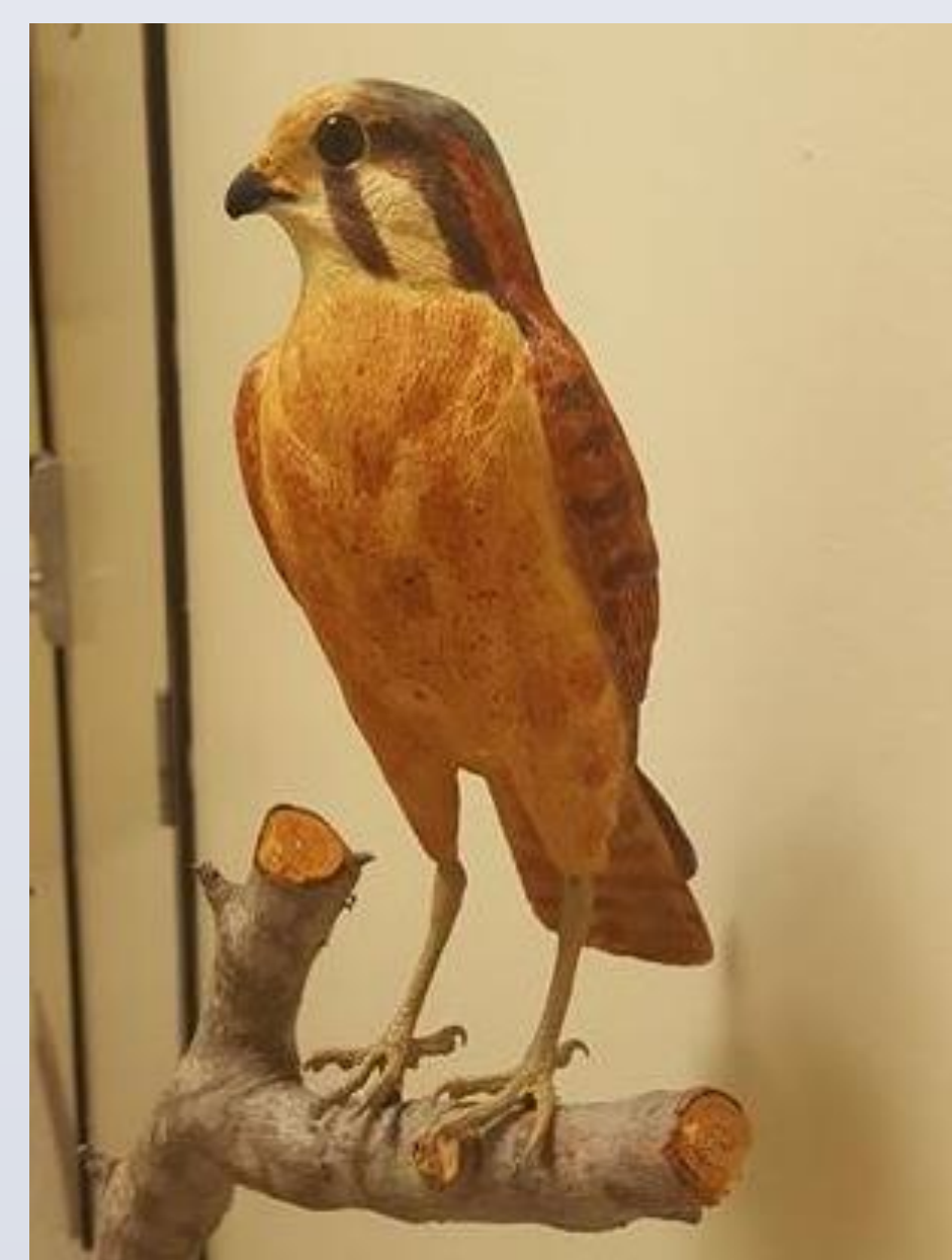
Female Kestrel Decoy