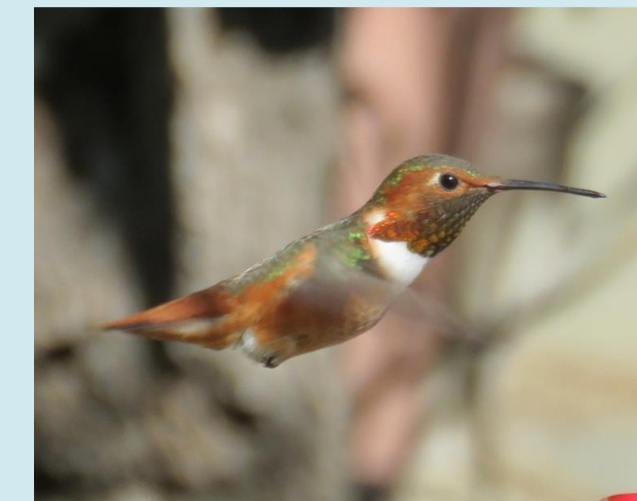
Male Allen's Hummingbird