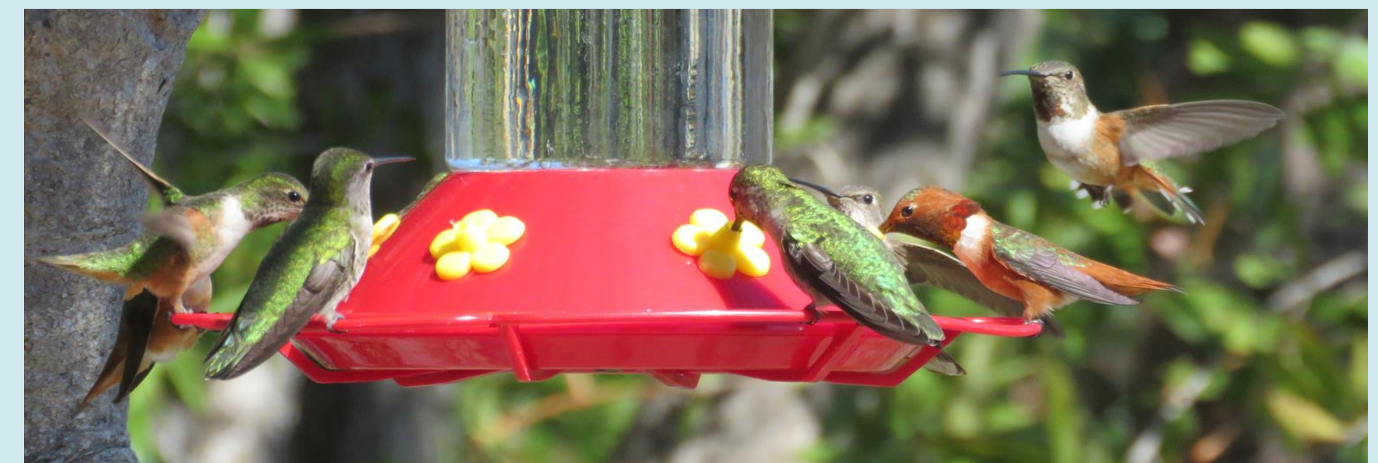
Hummingbird feeder on the Gottlieb property