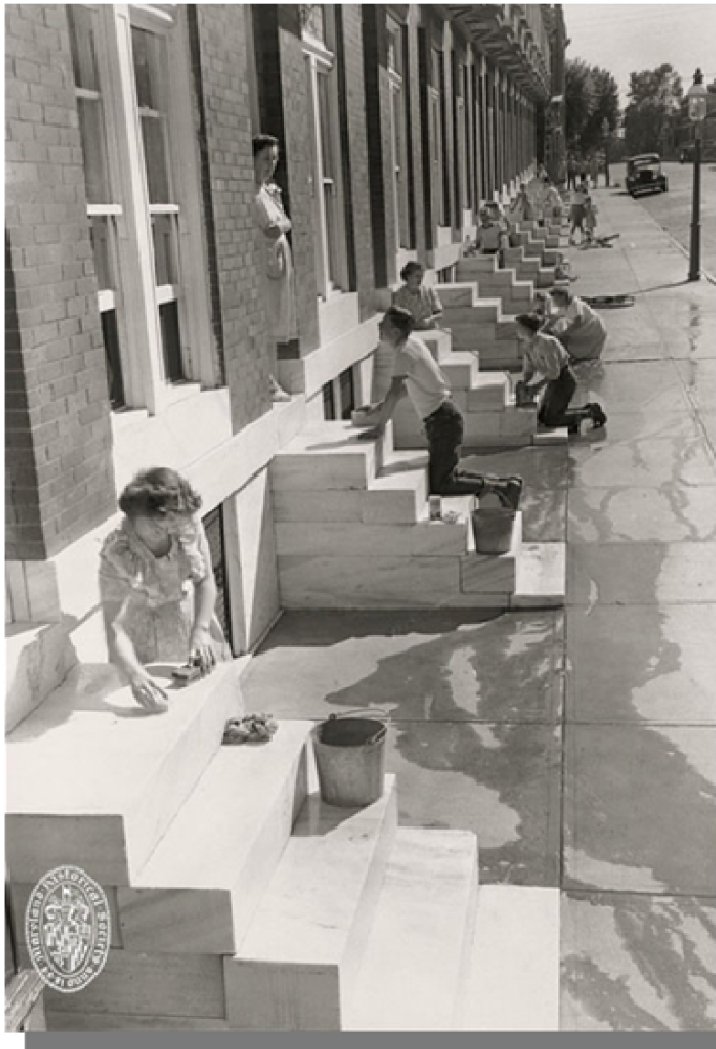
Figure 1. An example of “clean, uncluttered concrete” in Baltimore ca. 1948. Note the lack of tree pits in this block and the attention given to the condition of the marble steps (Photo taken by A. Aubrey Bodine, Courtesy of the Maryland Historical Society).

According to Galvin et al. (2006) and O’Neil-Dunne (2009), Baltimore will not be able to meet its UTC goal of 40 percent coverage by planting trees only in parks and along streets. In fact, such a strategy, even if carried out to its maximum potential, would fall far short. The greatest opportunities for increasing tree canopy in Baltimore depend on other lands. Moreover, they depend on the cooperation and collaboration of private landowners and other community stakeholders all across Baltimore.