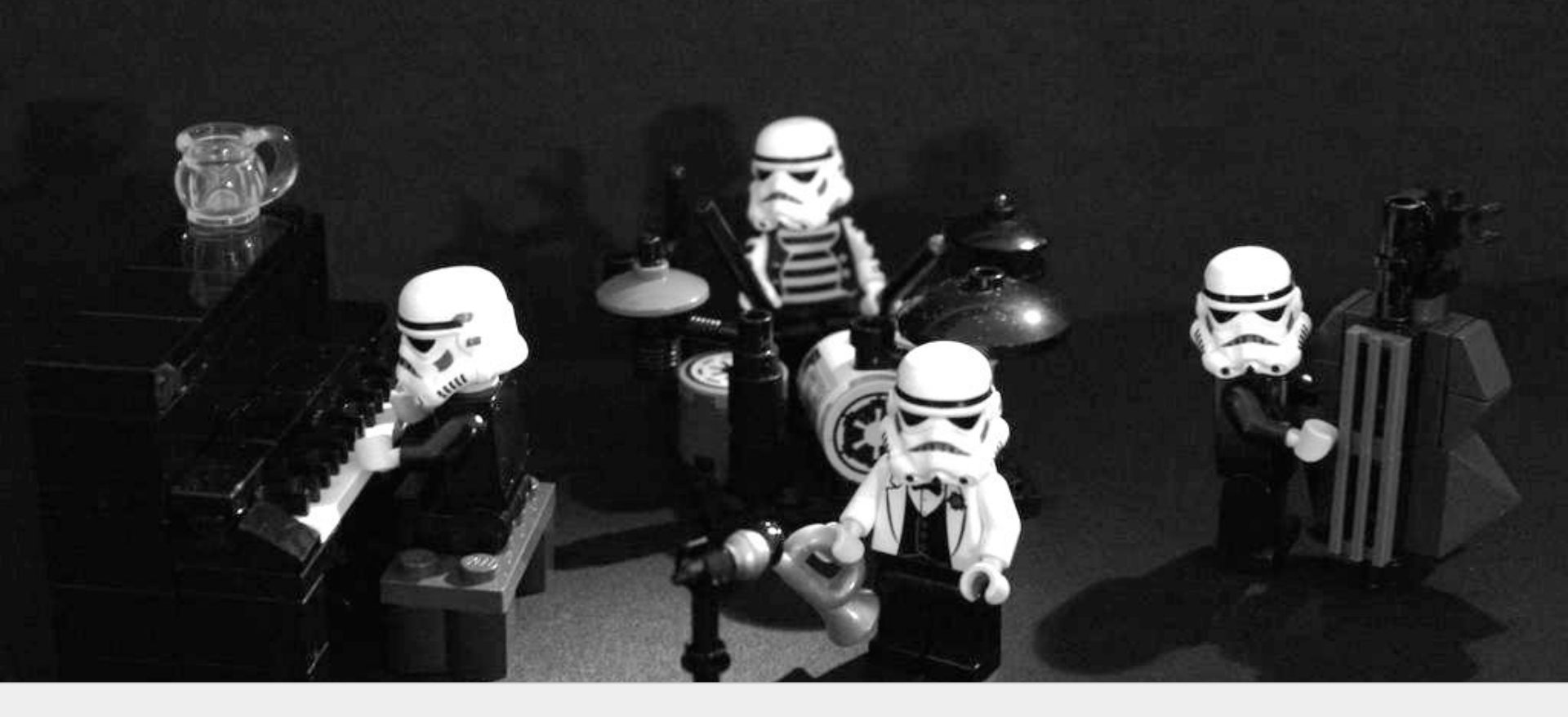
Efficient/Creative Marketing Strategies