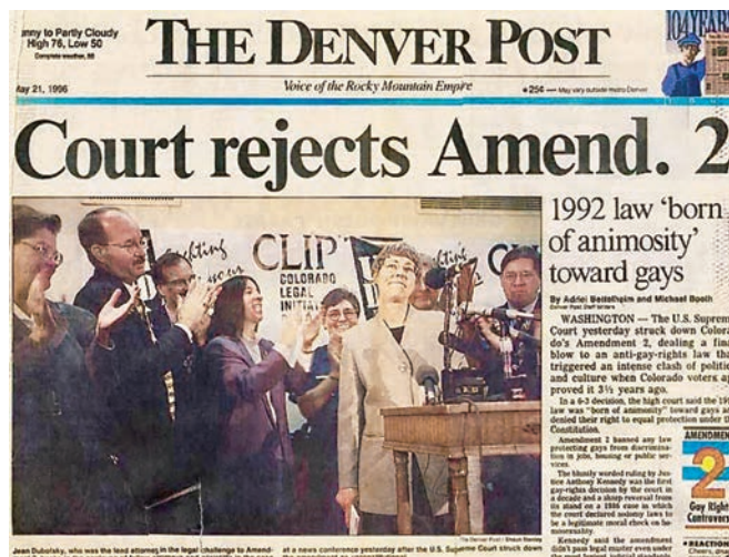
Figure 3. Headline announcing the US Supreme Court decision striking down Amendment 2.

On May 10, 1996, the US Supreme Court announced its decision in Romer v. Evans [23]. By a 6–3 majority, it ruled Amendment 2 unconstitutional, although for different reasons than those given by the Colorado Supreme Court.