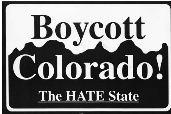
Figure 2. Boycott Colorado was formed as a way to fight back against attacks on anti-discrimination laws.

More importantly, the boycott took a serious toll on Colorado's reputation. From innumerable newspaper articles and other publicity, Colorado acquired the epithet "The Hate State." Within the state, many companies and individuals did what they could to counteract this. They adopted and publicized nondiscrimination policies covering sexual orientation, and some required any vendors they did business with to adopt similar policies. Among these efforts was the Colorado Alliance for Restoring Equality, a Denver-based group of businesses and community groups devoted to overturning Amendment 2 [26].