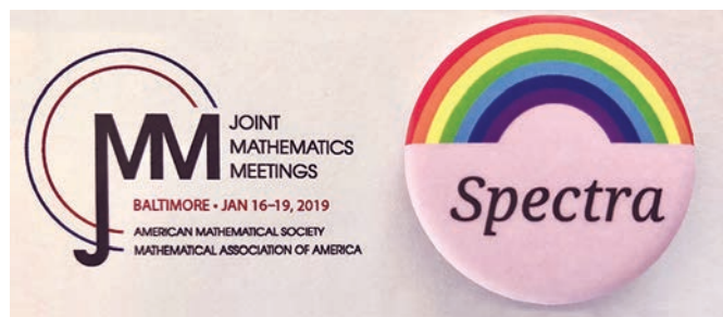
Figure 5. Pins that Spectra supporters could wear during the 2019 JMM to increase their visibility.

The visible presence of LGBT, nonbinary, and gender nonconforming people among mathematicians is an im-