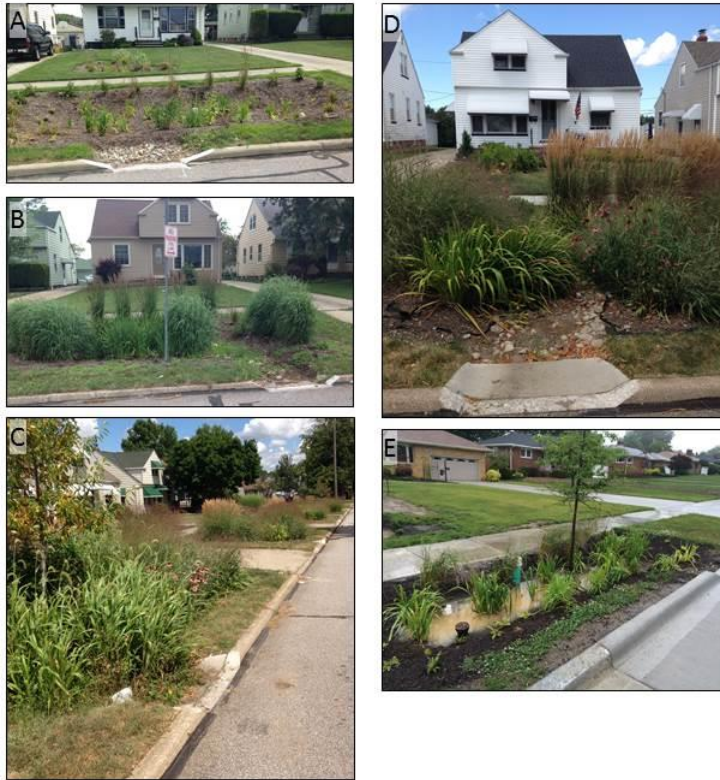
Figure 3 Views of green infrastructure on Klusner Avenue and Parkhaven Drive. (A) A bioretention cell (foreground) and rain garden (background) on Klusner Avenue shortly after planting. (B) A bioretention cell on Klusner Avenue after one year's growth. (C) A view along the street of bioretention cells along Klusner Avenue, after 2 years' growth. (D) Bioretention cell (foreground) and rain garden (background) on Klusner Avenue after two years' growth. (E) A bioretention cell on Parkhaven Drive during a rain event in August 2014.