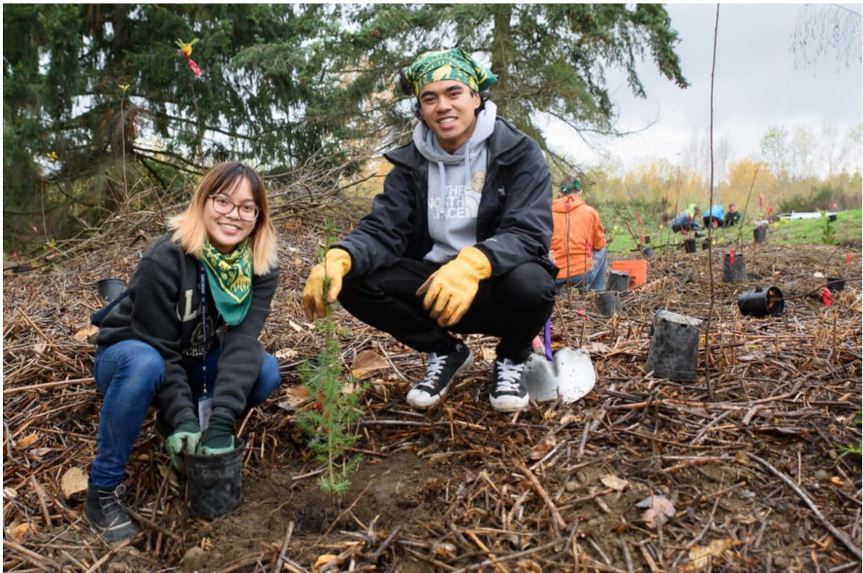
Image 2. Volunteers plant trees at Green Seattle Day at Magnuson Park