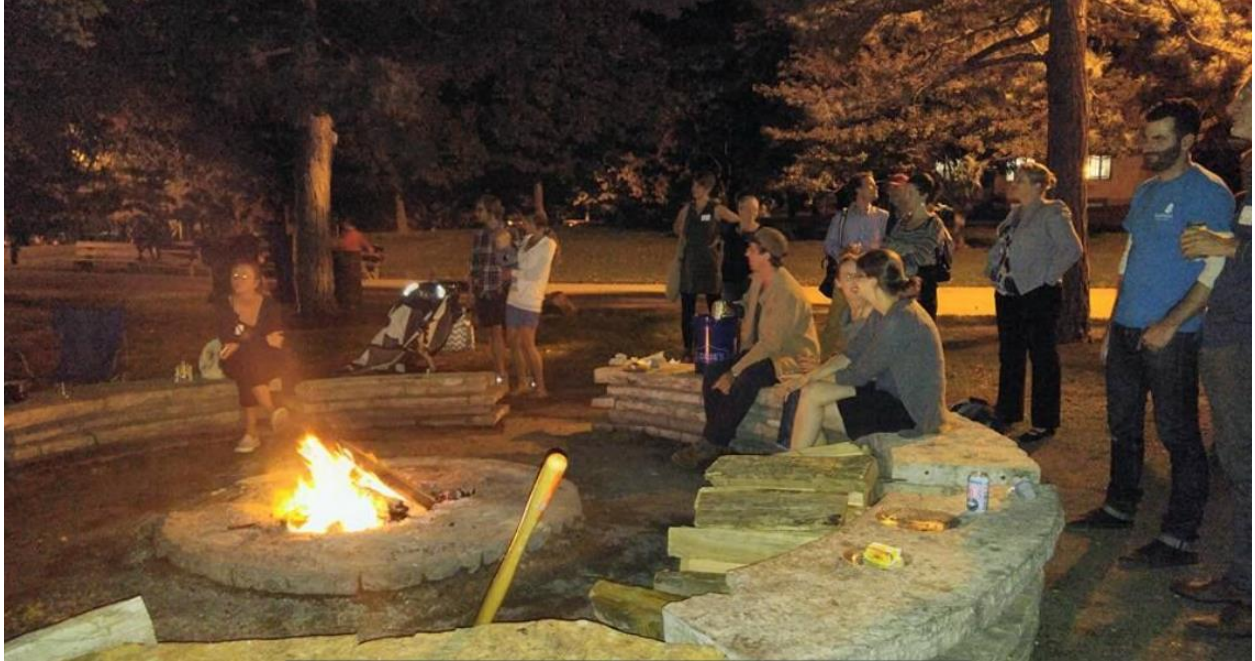
Image 2. CRTI Annual Meeting and Celebration Event hosted by the Chicago Park District