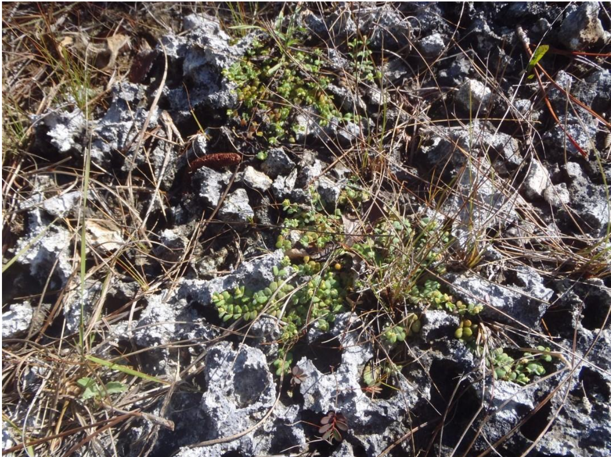
Image 1. The federally and Miami-Dade county endangered Goulds sandmat ( Euphorbia deltoidea ssp. adhaerans )

In 2012, the qualifying forest factors for the tax incentive and NFC program were incorporated into an updated quantitative evaluation form adopted by the Board of County Commissioners. Factors are presence of listed or endemic species, biodiversity, forest structure, forest size, habitat values, geology, and cover of exotic species. Additionally, the County code contains evaluation criteria used to nominate land to the EEL acquisition list. The criteria for evaluating the resource consists of biological value; vulnerability to degradation or destruction; the requirements (costs) for managing natural attributes; and the feasibility of meeting management requirements.