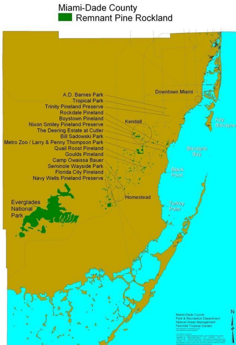
Figure 2. A representation of the remnant fragments of pine rockland habitat in Miami-Dade County