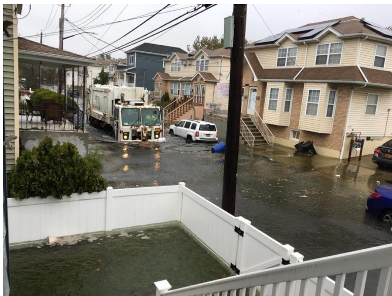
Figure 2: Flooding at First Street in Hamilton Beach, Queens NY 11414