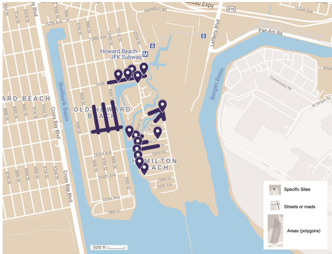
Figure 4: Howard Beach/Hamilton Beach chronic flooding observations. Data source: base map from Google Maps, overlaid with hand drawn flooding observations digitized from interviews. Map created by Helen Cheng. Observations recorded as points, lines, or polygons depending on how participants identified the location on the map.