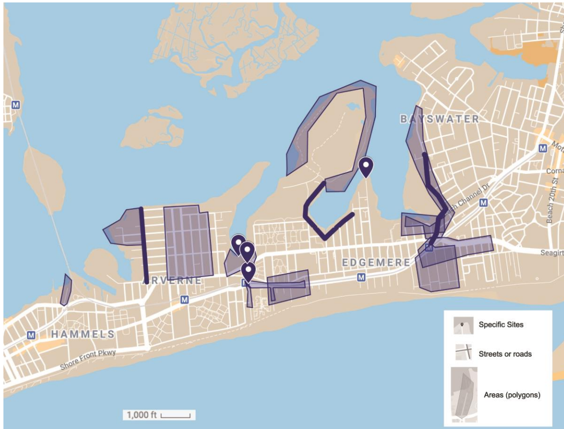
Figure 5: Rockaway chronic flooding observations. Data source: base map from Google Maps, overlaid with hand drawn flooding observations digitized from interviews. Map created by Helen Cheng. Observations recorded as points, lines, or polygons depending on how participants identified the location on the map.

NYC Community Flood Watch participants have a finely honed local ecological knowledge that includes deep knowledge of exactly which streets and parcels are particularly flood prone. Long-term residents of these coastal communities described Hurricane Sandy as the “wake-up call” for the general public on the realities of living with sea level rise and flooding — a reality that they had been experiencing over several decades. Respondents reflected on chronic flooding as an everyday experience: