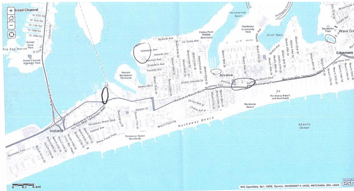
Figure 3: Example of hand-drawn map of flooding observations from a Rockaway participant.