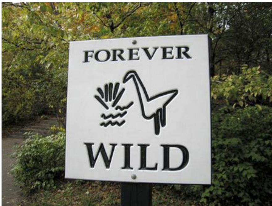
Figure 2. Forever Wild sign first installed in 2004.

From 2003 to 2008, NYC Parks received state and city funding to develop Forever Wild guidelines and promotional materials, to install signage and protective measures, and to revise the list of Forever Wild sites. This resulted in further formalization of the program through an official page on the NYC Parks website, informational and rules signs in Forever Wild areas (see Figure 2), and management guidelines intended for internal use by NYC Parks staff. These guidelines included recommendations for how regular operations across the agency should be modified in Forever Wild sites – for example, NYC Parks maintenance vehicles should only be driven on paved paths, salt piles for winter weather response should not be stored within Forever Wild sites, among many others in the 30-page document.