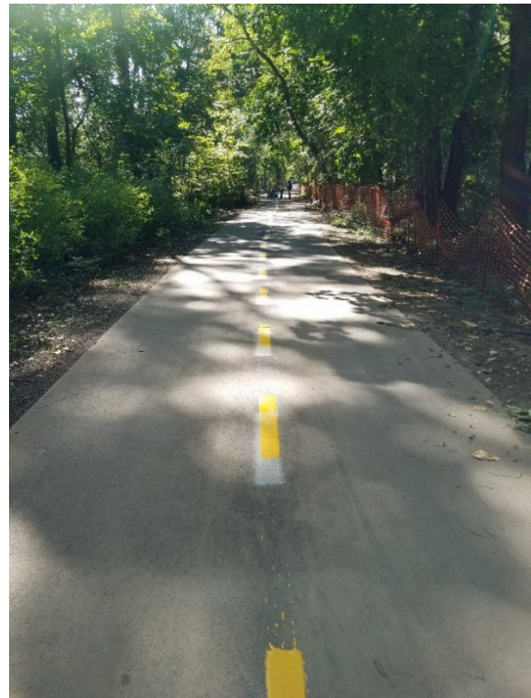
Figure 5. The Putnam Greenway in Van Cortlandt Park, Bronx, NY.

Given this context, NYC Parks has worked to find opportunities for natural areas to serve multiple stakeholders and meet multiple public needs without compromising natural resource