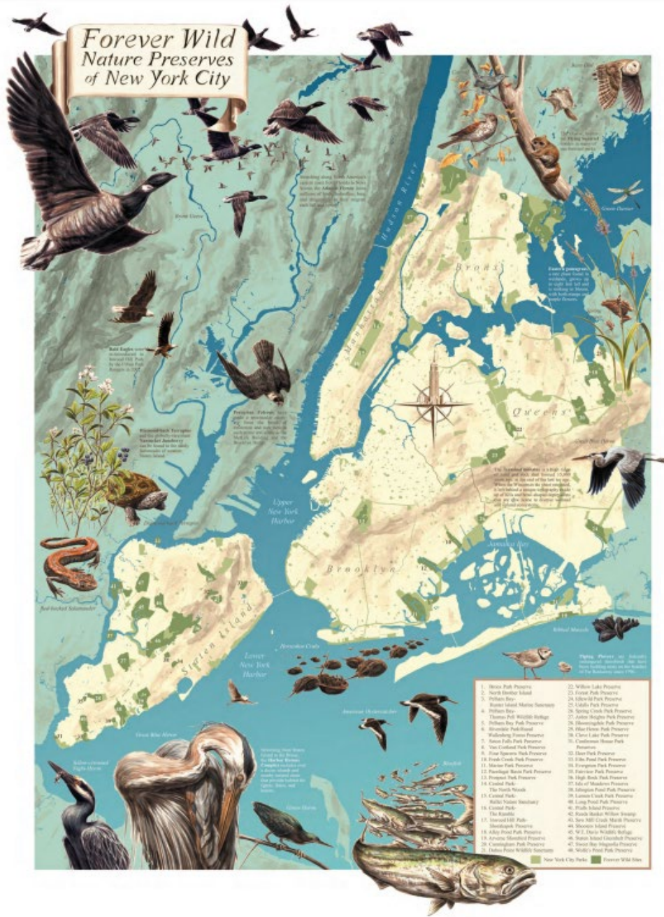
Figure 1. Forever Wild Map, 2004.

legal standard has been created, and actions in keeping or in conflict with the Forever Wild program are not subject to external review or sanctions.