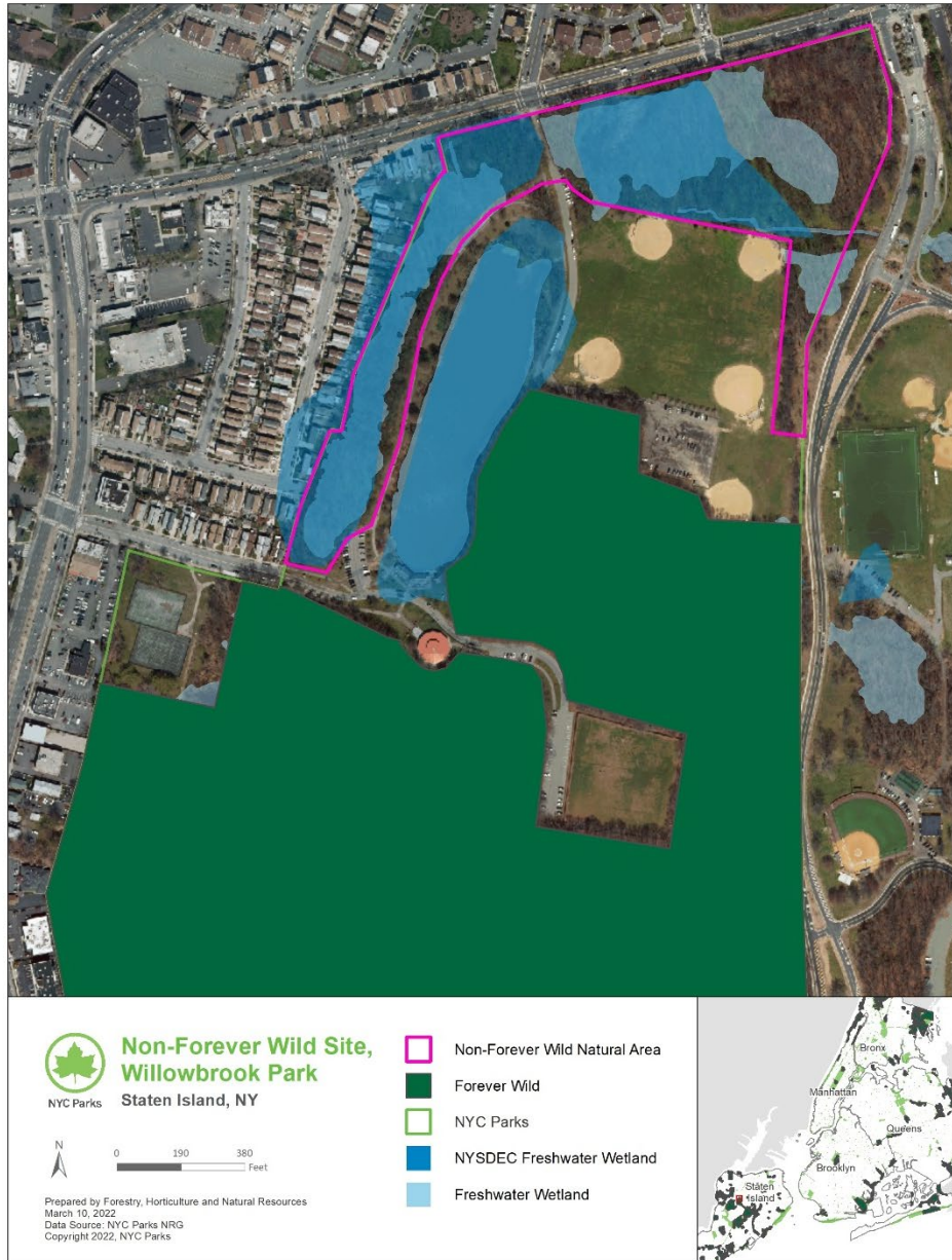
Figure 4. Willowbrook Park, Staten Island.